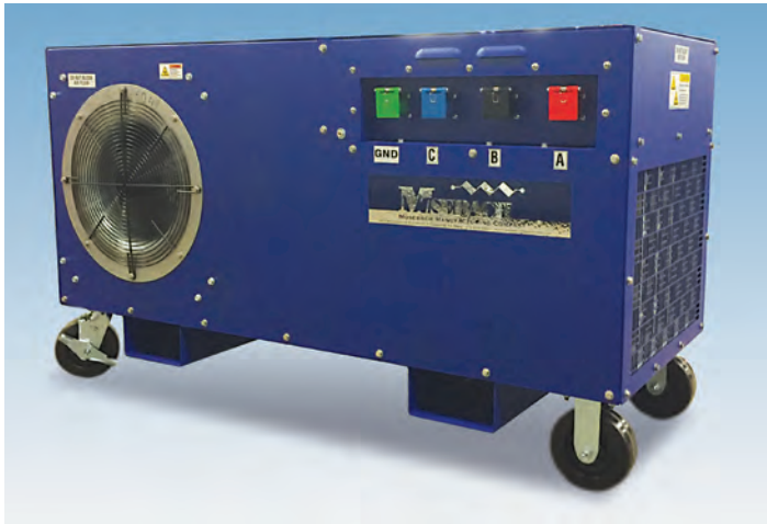
150 kW Portable Electric Heater

Heaters are available in the sizes of 60 kW and 150 kW. Mosebach's heaters are virtually maintenance free and are used anywhere from construction sites and nuclear power plants to fine dining and special outdoor events.