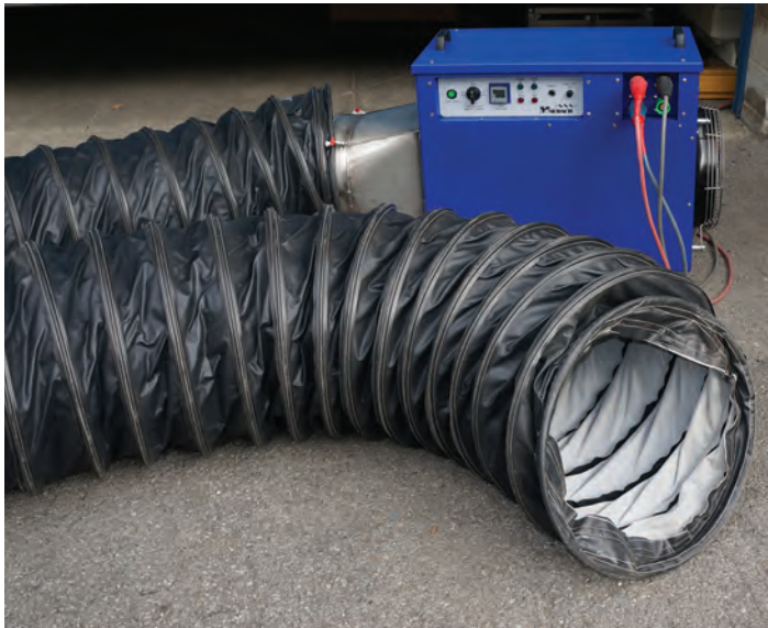
60 kW Small Lightweight Portable Electric Heater