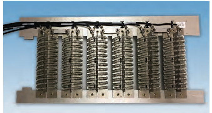
Cross Wire Resistor

Mosebach's cross wire resistor is used in almost every load bank to obtain 5 kW resolution. There are no ceramics or welds used so these resistors last much longer and can withstand more shock/vibration.