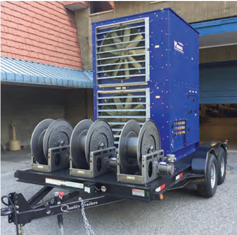
XM1500 Load Bank

Virtually any of our load banks can be mounted on a DOT certified dual axle trailer with brakes to meet your needs. Trailer mounted units can come with electric cable reels or a job box for easy clean up and cable storage. Trailer mounted units allow customers to test multiple generators in one day.