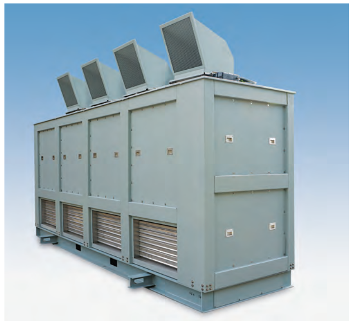
Dual Voltage 4000 kW DC Load Bank