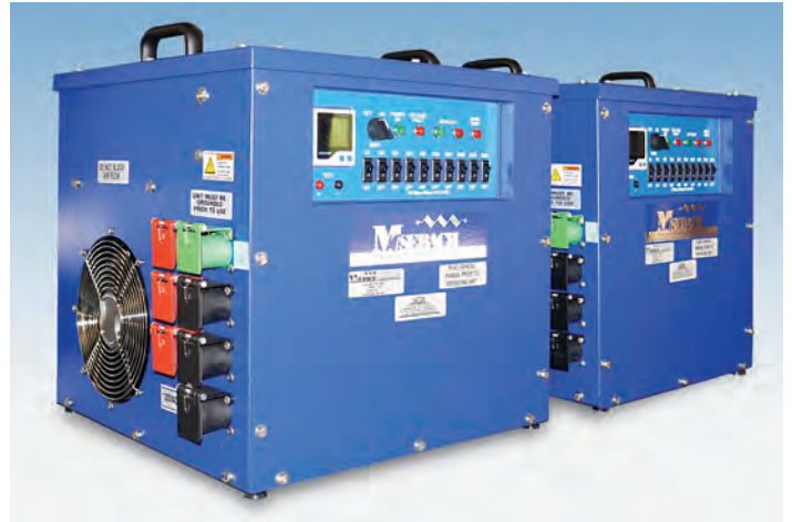
DC Load Banks

Our direct current line of load banks is perfect for customers who need to test DC power systems or battery systems. With a variety of voltages and amp capacity, we are sure to have what you require! We offer a variety of both portable and permanently mounted units.