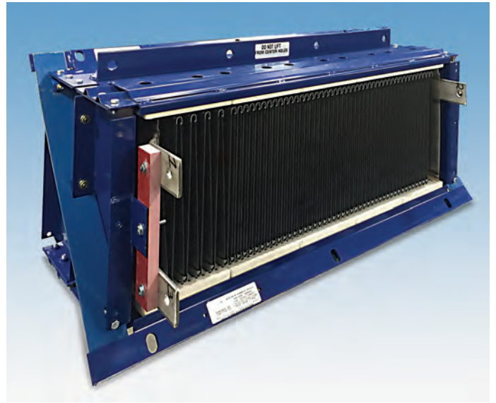
Box Style Grid for EMD Locomotives