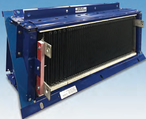
Dynamic Braking Resistors