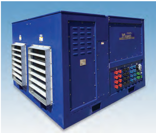
XL3000 Load Bank

Our resistive load banks range from small and portable to permanently mounted outdoor units. We offer power ranges from 30 kW to 3000 kW and higher. Our load banks can test all single-phase and three-phase voltages including 600V and 4160V.