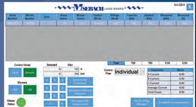
Remote Control Software