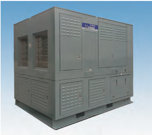
2500 kW 1875 KVAR Load Bank

Our Resistive Reactive load banks can handle your inductive requirements. Please contact us for additional information.