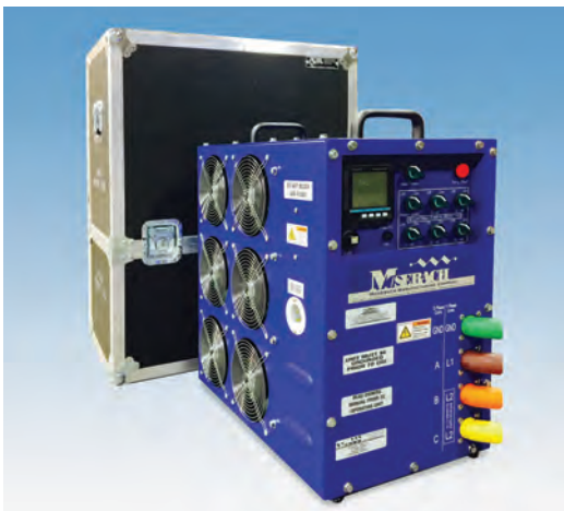
X100S Load Bank