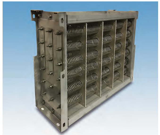
Suspended Wire Resistor

Mosebach's suspended wire resistors are NiCor metal coils supported by Mica that can sustain anywhere from 0-3000 kW. These are used in conjunction with the cross wire resistors to get smaller kW steps.